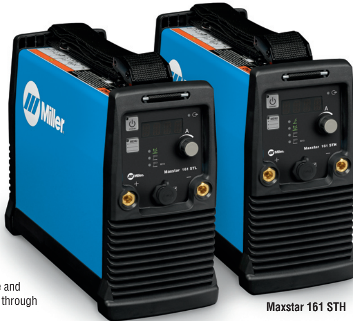
Maxstar 161 STL

Built-in gas solenoid eliminates the need for a bulky torch with a gas valve.