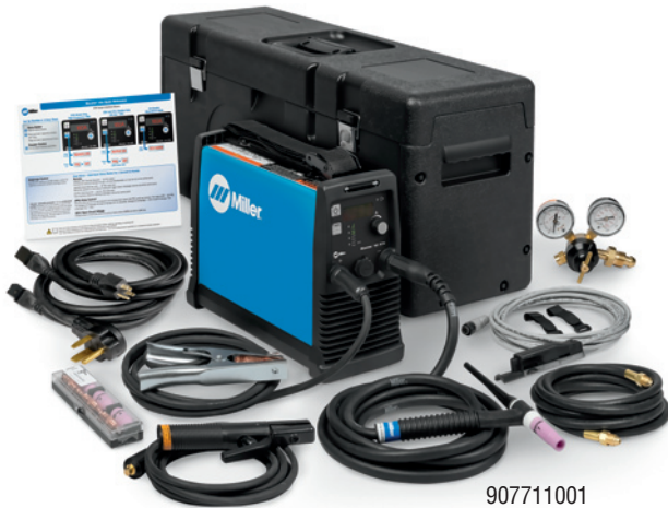
90771001 package shown.

STL TIG/Stick Package 907710001 STL TIG/Stick Package with Remote Fingertip Control 907710002 STH TIG/Stick Package with Remote Fingertip Control 907711001