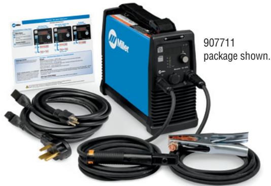
907711 package shown.

STL Standard Package 907710 STH Standard Package 907711