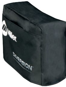
Protective Cover 300579

219259 For power cable 5-20P (120 V/20 A). Optional, not included with Diversion.