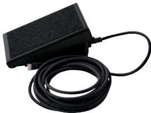
RFCS-RJ45 Remote Foot Control 300432

North/south rotary-motion fingertip current and contactor control attaches to TIG torch using two hook-and-loop fasteners. Great for applications that require a finer amperage control. Includes 13.25-foot (4 m) cord with plug.