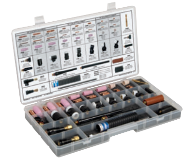
TIG Torch Accessory Kit AK-150MFC

TIG/Multitask Gloves 263352 Small 263353 Medium 263354 Large 263355 X-Large Goat grain leather with dual-padded palm and wool back.