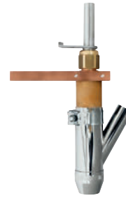
1200-Amp Twin-Wire Torch 301144 Long, 16.8 in. (427 mm) 1,200 amps at 100 percent duty cycle. For 3/64–3/32 inch (1.2–2.4 mm) wires.