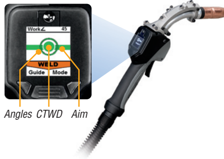
Angles CTWD Aim

ArcStation™ base features a 1/2-inch reversible steel table top and ships complete with drawers, gun holder, quick-release clamps and heavy-duty casters for mobility.