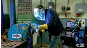
What it is

Visit us on YouTube for informative videos on: