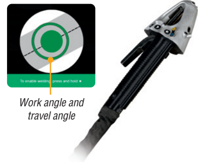
Work angle and travel angle

SmartGun is a glove-friendly, industry-exclusive 400-amp MIG gun featuring built-in LEDs that are tracked by the system's cameras. The ergonomic soft-grip handle provides tactile vibration feedback that helps guide real-time performance adjustments, reinforcing optimal position and movement. The OLED display on the SmartGun provides initial visual feedback to guide proper gun positioning. Pushbuttons provide a convenient alternative to the touchscreen for navigation.