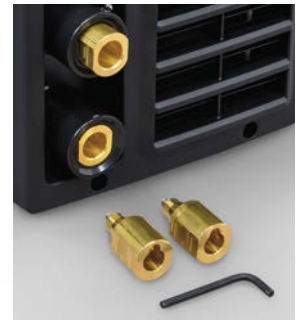
CST 282 with Tweco-style receptacles shown.

Universal connector system allows the machine to be quickly configured to either Tweco®- or Disne-style receptacles. Extra receptacles and wrench shown are sold separately as Universal Connector Kits (see page 4).